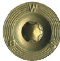
FIGURE 2. BIG TIMBER® CTX CONSTRUCTION LAG SCREW HEAD MARKINGS