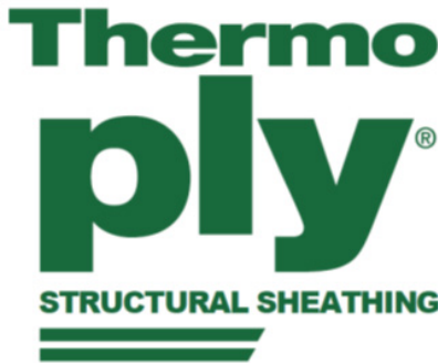
FIGURE 1. THERMO-PLY® GREEN STRUCTURAL SHEATHING

4.1 The product evaluated in this TER is shown in Figure 1.