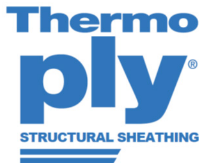
FIGURE 1. THERMO-PLY® BLUE STRUCTURAL SHEATHING