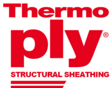
FIGURE 1. THERMO-PLY® RED STRUCTURAL SHEATHING

4.1 The product evaluated in this TER is shown in Figure 1.