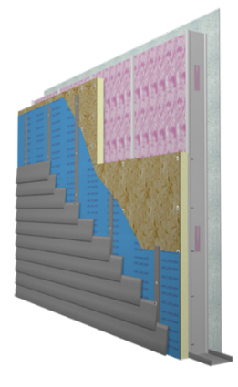
Figure 1. R2+ SILVER, R2+ MATTE and R2+ BASE

4.2 The foam core of R2+ SILVER, R2+ MATTE and R2+ BASE is manufactured in accordance with ASTM C1289.