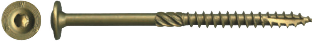
Figure 1. CTX Construction Lag Screw