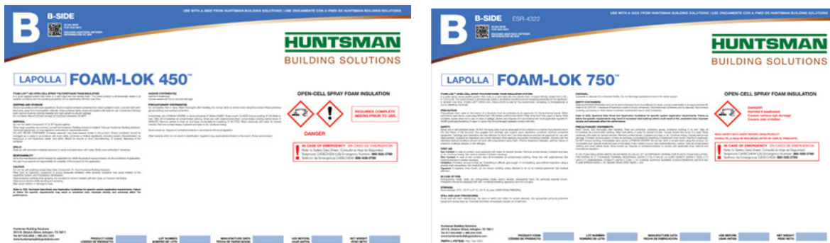
Figure 1. Foam-LOK FL-450 and Foam-LOK FL-750 SPF in Unventilated Attics

2.1 The innovative products evaluated in this report are shown in Figure 1 .