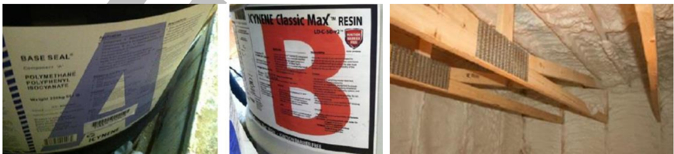
FIGURE 1. ICYNENE CLASSIC PLUS SPF IN UNVENTILATED ATTICS