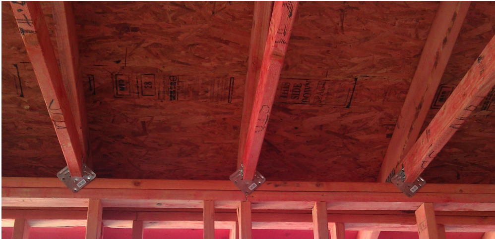
Figure 1. TECHWOOD 4400 Product

4.1 The product evaluated in this TER is shown in Figure 1 and Figure 2.