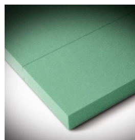
GreenGuard® XPS SB