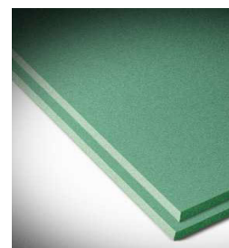
GreenGuard® XPS SL