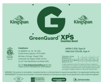
GreenGuard® XPS Label